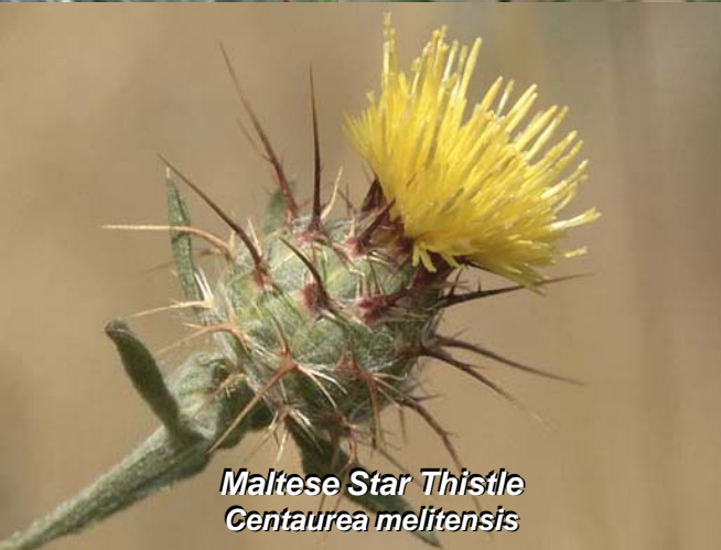
Maltese Star Thistle Centaurea melitensis