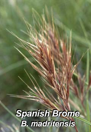
Spanish Brome B. madritensis