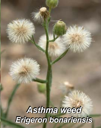
Asthma weed Erigeron bonariensis