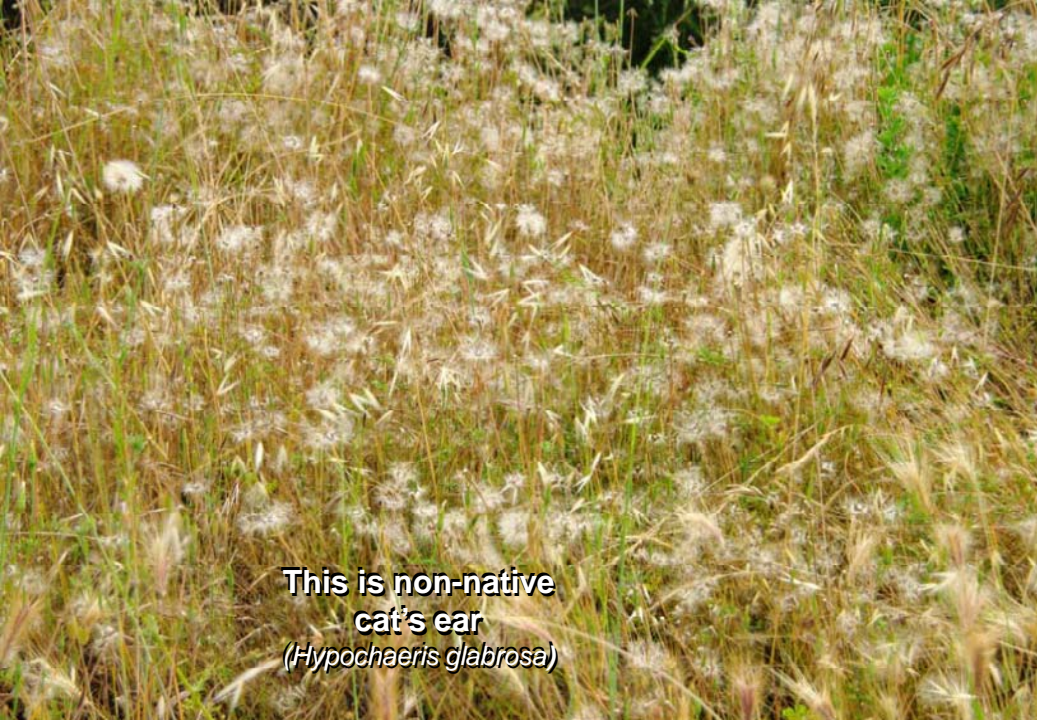
This is non-native cat's ear ( Hypochaeris glabrosa )