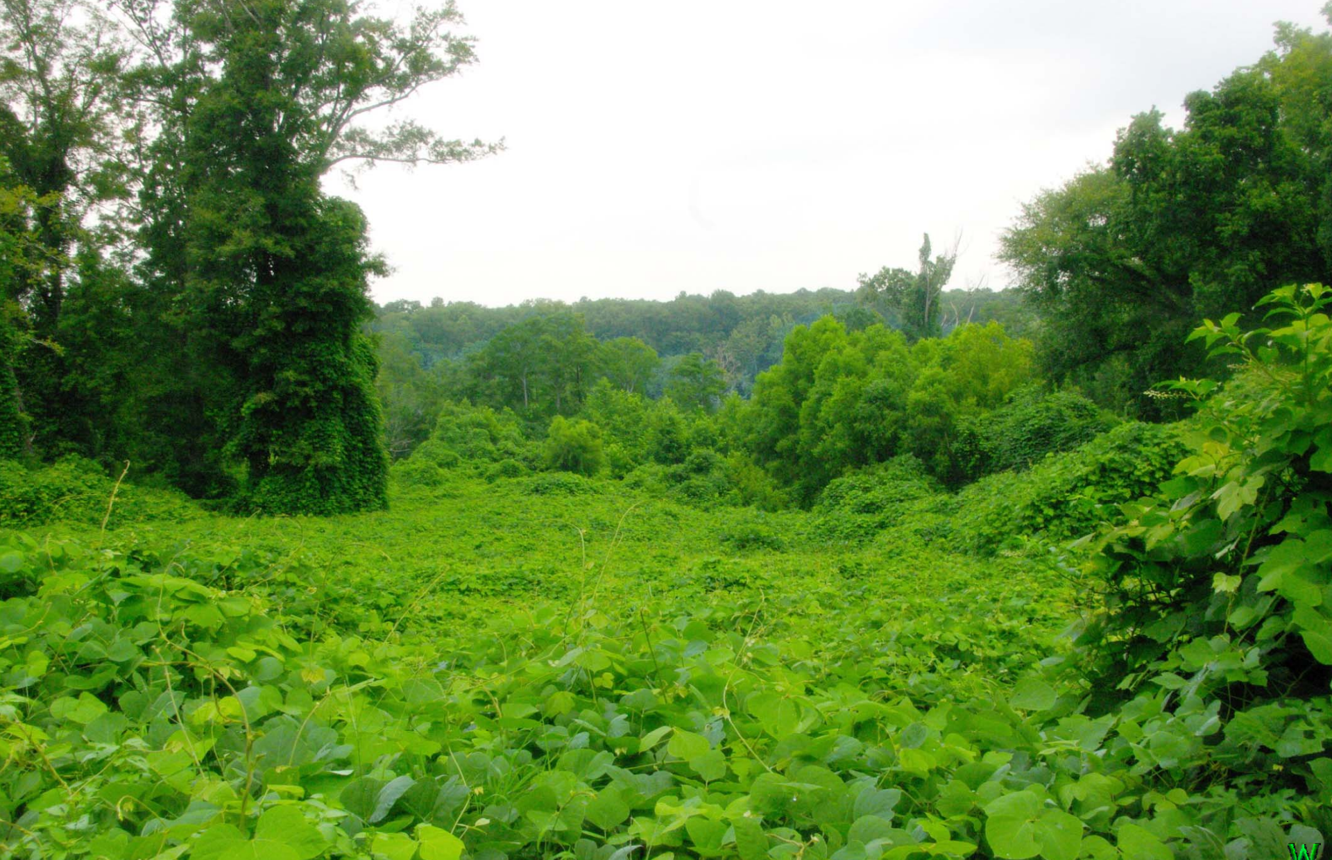
July 2010, near Wetumpka, Alabama

As a special subset of “bad plants,” invasive exotics build massive monocultures, meaning that they tend to exclude all other plants. These pests are displacing native plants, worldwide. The US Soils Conservation Service introduced kudzu as an erosion control... Well, it certainly worked for that.