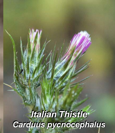
Italian Thistle Carduus pycnocephalus