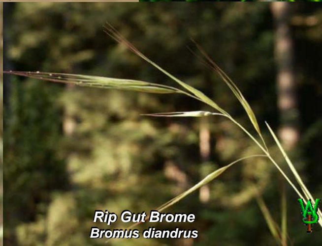
Rip Gut Brome Bromus diandrus

As a final element to this, “Are non-natives always bad?” question, almost all of the exotic plants we are talking about are those that people have already found to be generally undesirable for residential or agricultural use. Most would be considered bad plants just about anywhere.