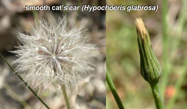
smooth cat's ear ( Hypochoeris glabrosa )

Of these dandelions, only cat's ear (on this row) is non-native.