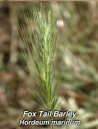
Fox Tail Barley Hordeum marinum