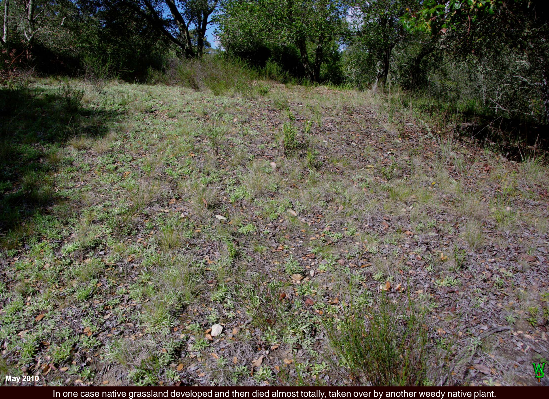
In one case native grassland developed and then died almost totally, taken over by another weedy native plant. Where it was going carried significant hazards; it did not look promising.