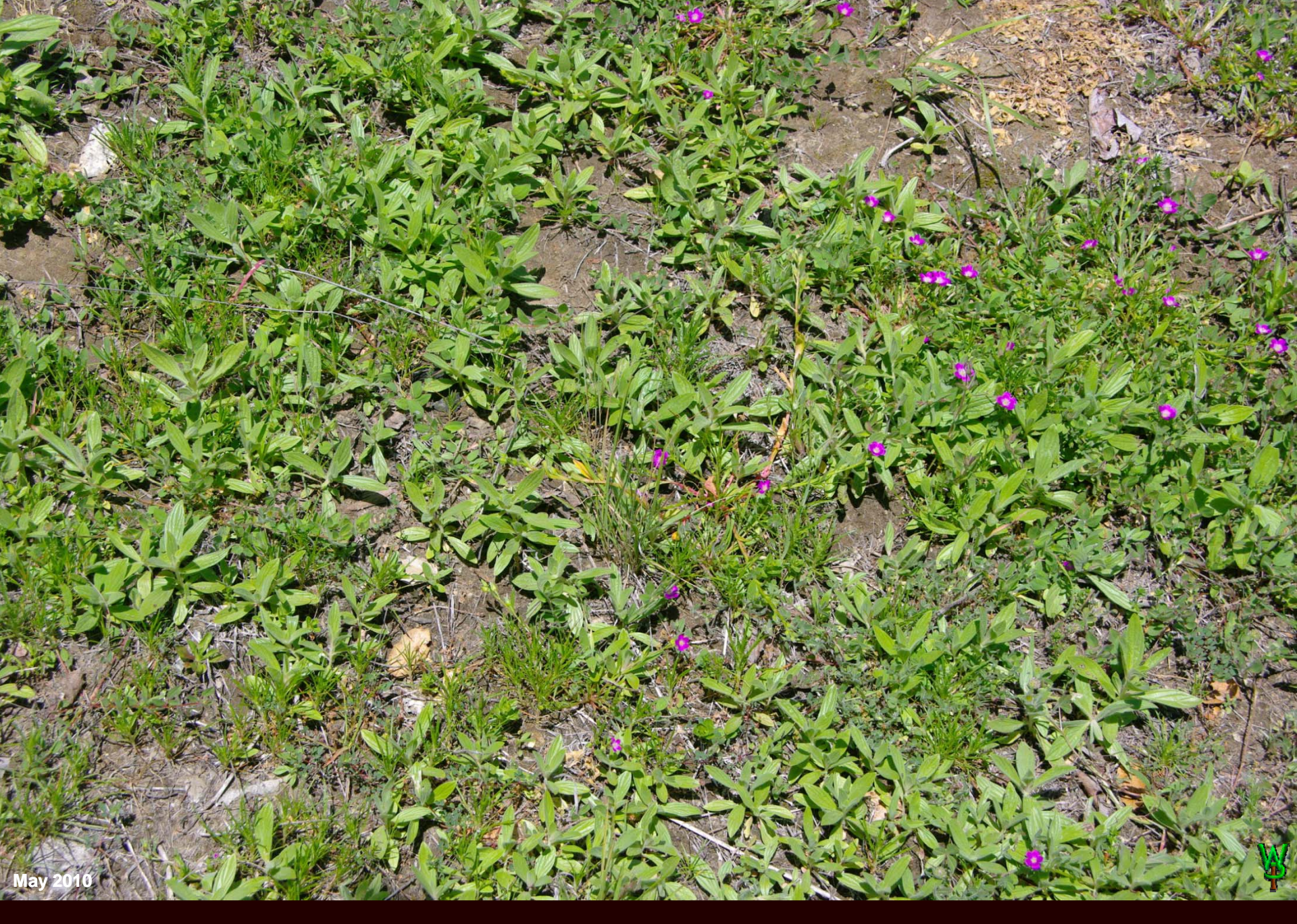
Some meadows here have sand-hill species present and vice versa.