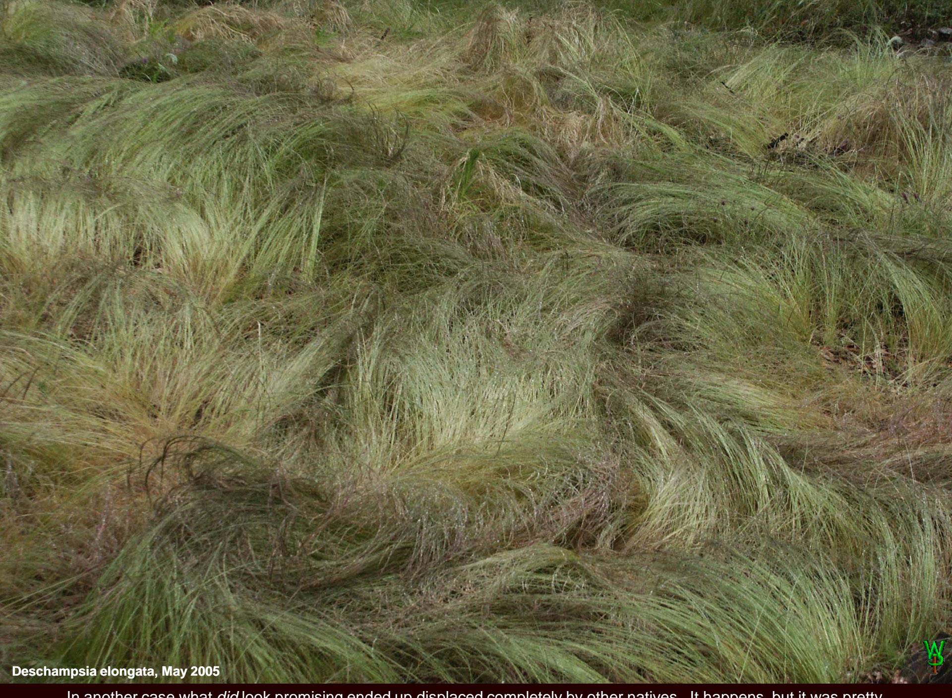
In another case what did look promising ended up displaced completely by other natives. It happens, but it was pretty.