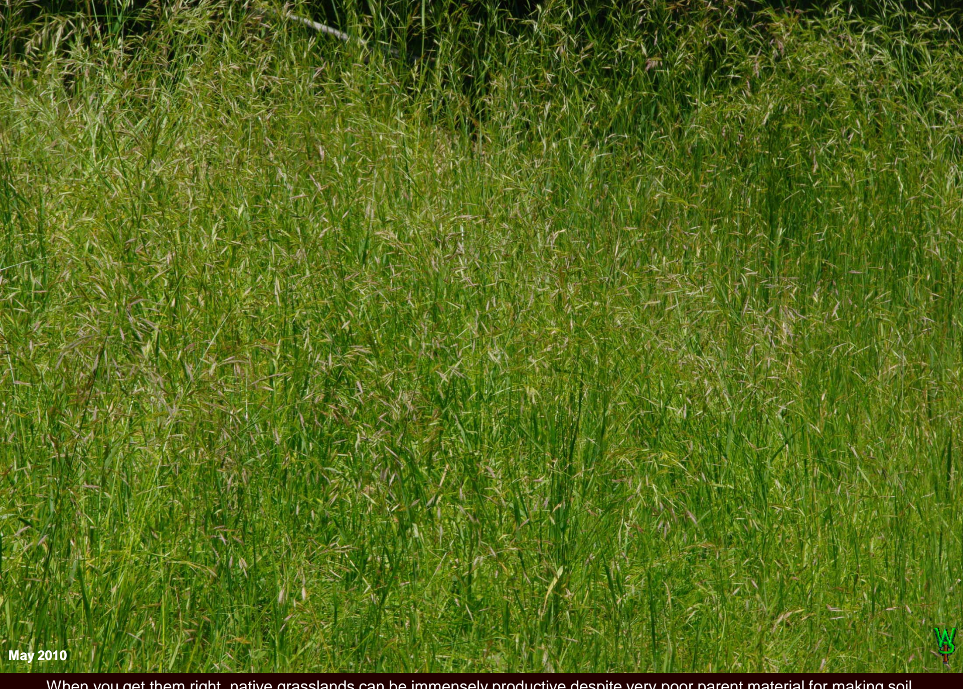
When you get them right, native grasslands can be immensely productive despite very poor parent material for making soil. What you can see is almost all California brome ( B. carinatus ). We will soon get to what you can't see.