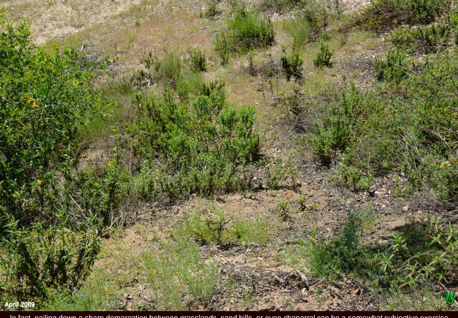
In fact, nailing down a sharp demarcation between grasslands, sand hills, or even chaparral can be a somewhat subjective exercise more determined by what stage of succession appears to be dominant at the time. You know when you are in the middle of one, but at the edges, not so much.