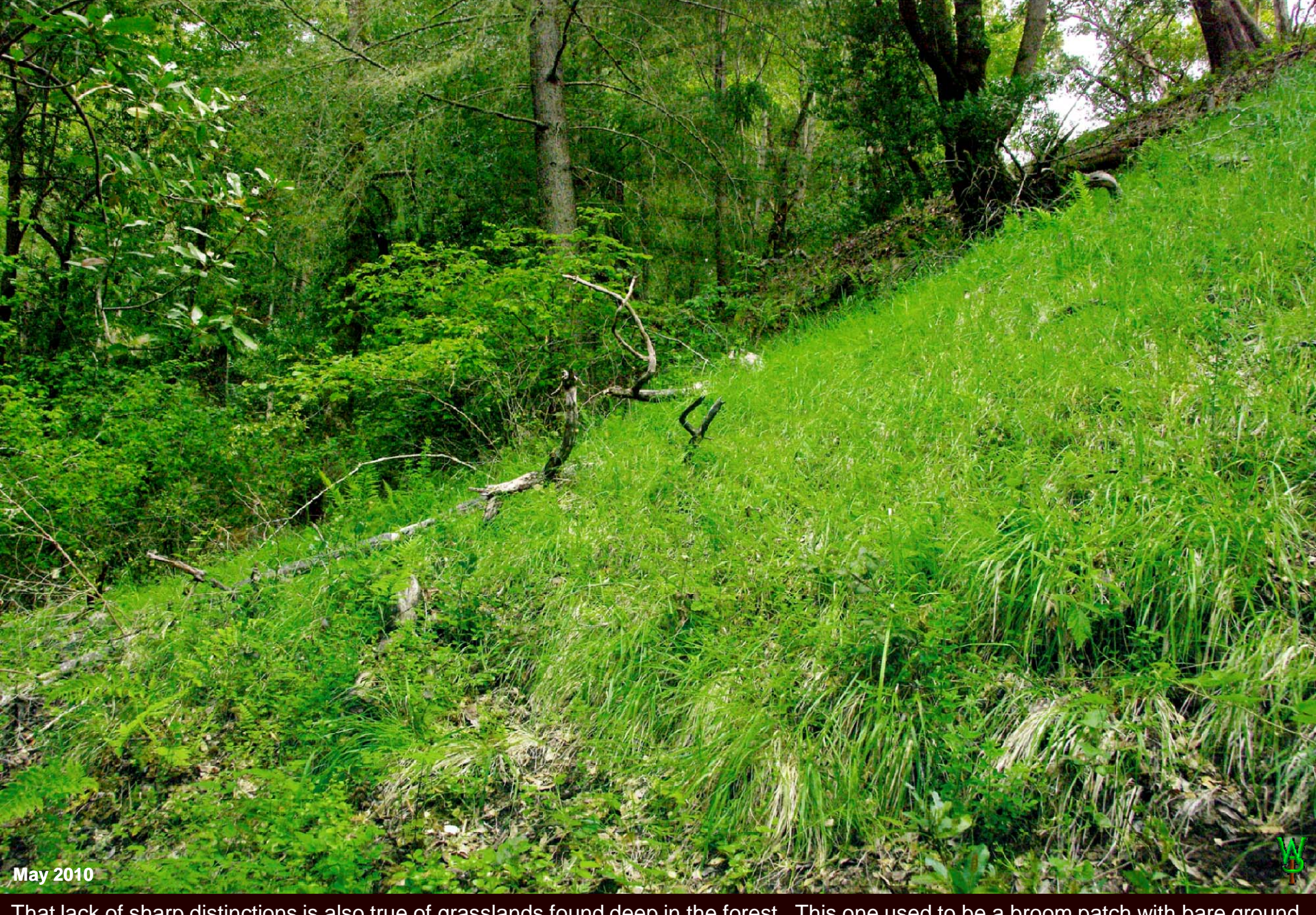
That lack of sharp distinctions is also true of grasslands found deep in the forest. This one used to be a broom patch with bare ground. It now has Torrey's melic ( M. torreyana ), pine grass ( Calamagrostis rubescens ), and small-flowered needle grass surrounded with roses, hazelnuts, and ferns. But even as remote as it is, this meadow shares one thing in common with all the others: weeding.