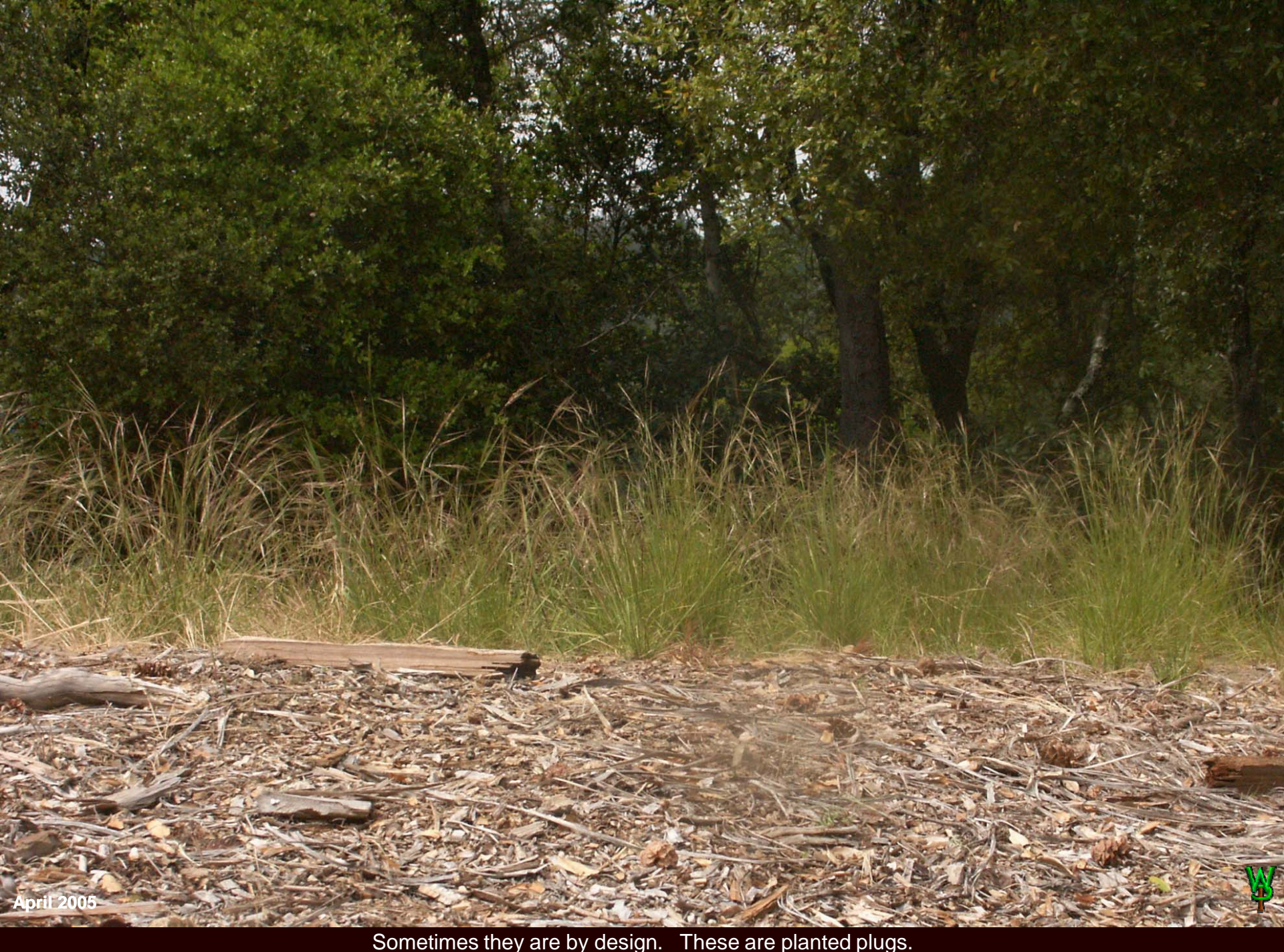
Sometimes they are by design. These are planted plugs.