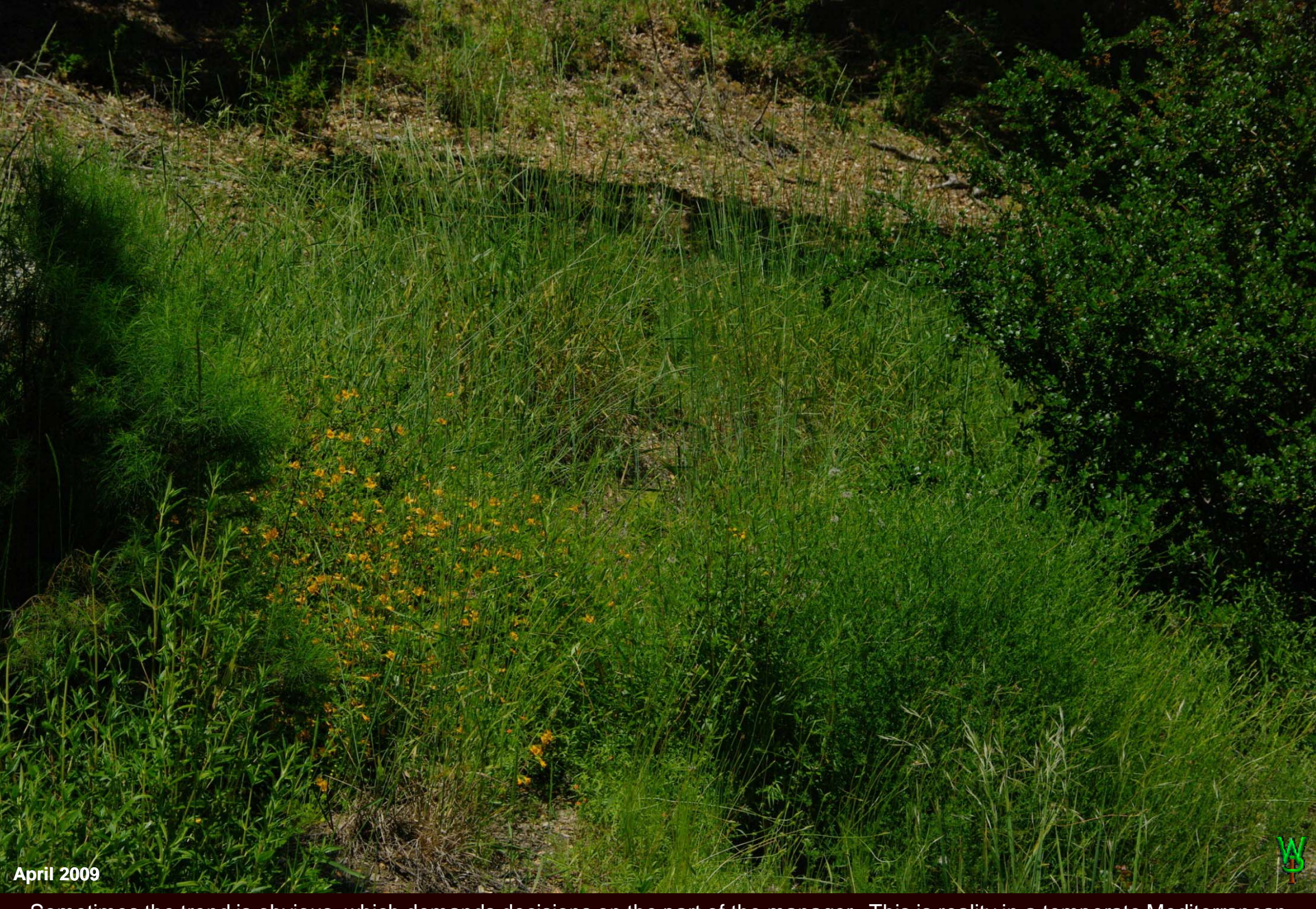
Sometimes the trend is obvious, which demands decisions on the part of the manager. This is reality in a temperate Mediterranean climate like this: vegetation is in constant transition, one successional stage displacing the next until there is a disturbance. Rarely are such systems stable on their own.