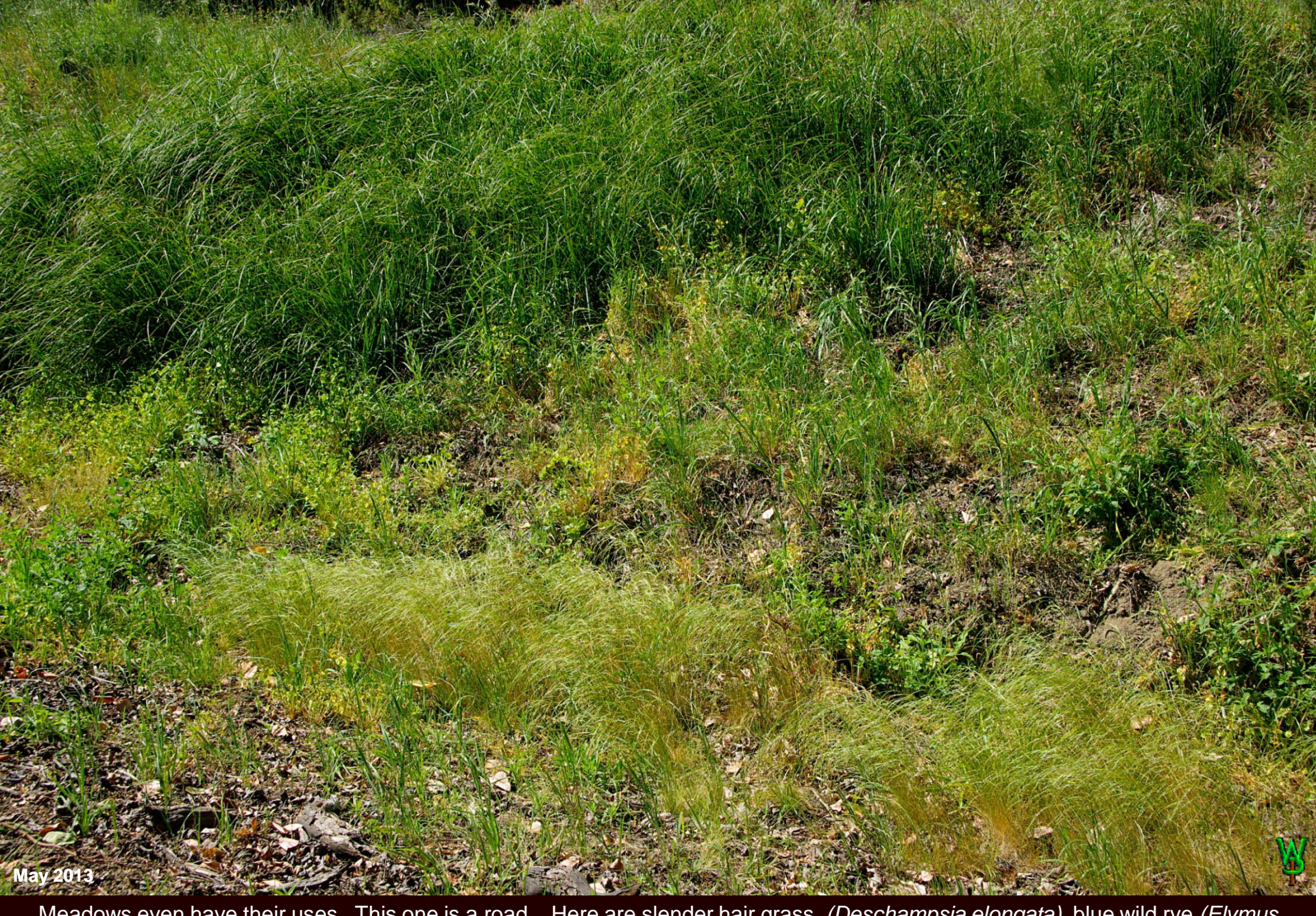
Meadows even have their uses. This one is a road. Here are slender hair grass, (Deschampsia elongata), blue wild rye (Elymus glaucus), (Bromus carinatus), miner's lettuce (Claytonia perfoliata), monkey flower, Santa Barbara sedge (Carex barbarae), foothill sedge (C. tumulicola), and of course weeds, but at least not many, the worst is chickweed (Stellaria media).