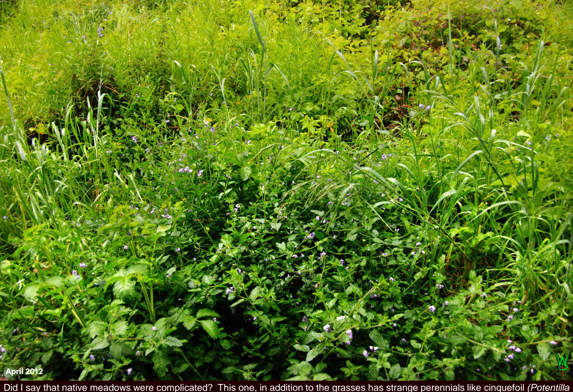
Did I say that native meadows were complicated? This one, in addition to the grasses has strange perennials like cinquefoil ( Potentilla glandulosa ), blue witch ( Solanum umbelliferum ), strawberries ( Fragaria vesca ), blackberries ( Rubus ursinus ), and annuals like pink cudweed ( Gnaphalium ramosissimum ) that can get five or six feet tall and as wide (if I let them). This is right in front of the house. I keep thinking from time to time that I should landscape it. M-m-maybe not just yet. I do mow it at the end of the year though.