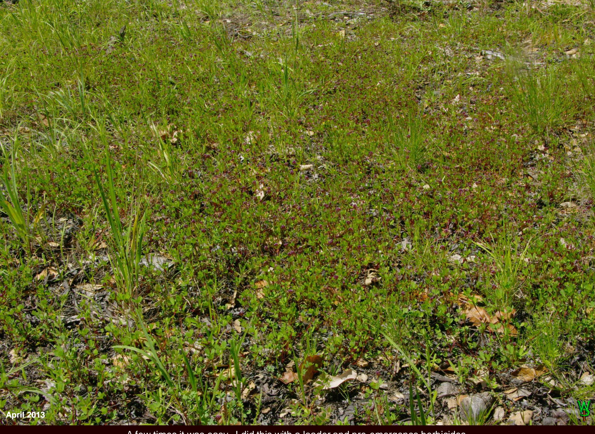
A few times it was easy. I did this with a loader and pre-emergence herbicides.