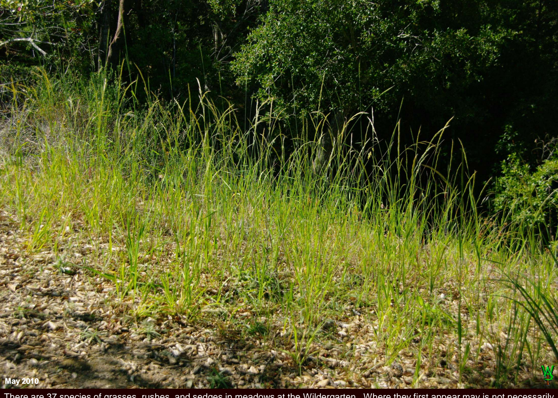
There are 37 species of grasses, rushes, and sedges in meadows at the Wildergarten. Where they first appear may is not necessarily demonstrative of where they are best suited. This is (mostly) nodding Trisetum ( T. cernuum ), which is still spreading on the property.