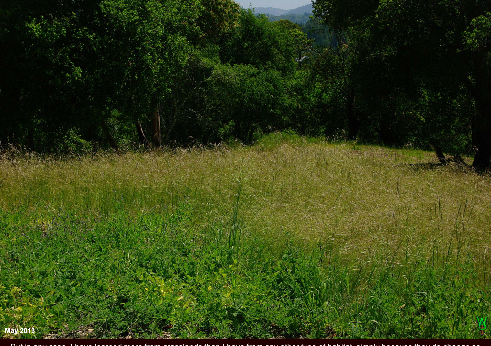
But in any case, I have learned more from grasslands than I have from any other type of habitat, simply because they do change so greatly from year to year. So, now that you've made your introductions, it's time to get started with what was involved.