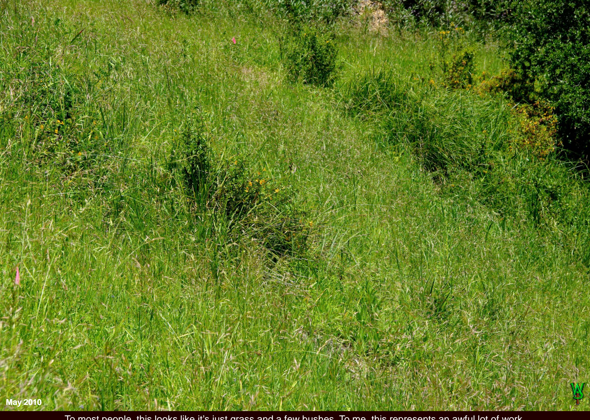
To most people, this looks like it's just grass and a few bushes. To me, this represents an awful lot of work. I had just taken a 40 pound rice bag of weeds out of this area of maybe 25 X 40 feet the same day.