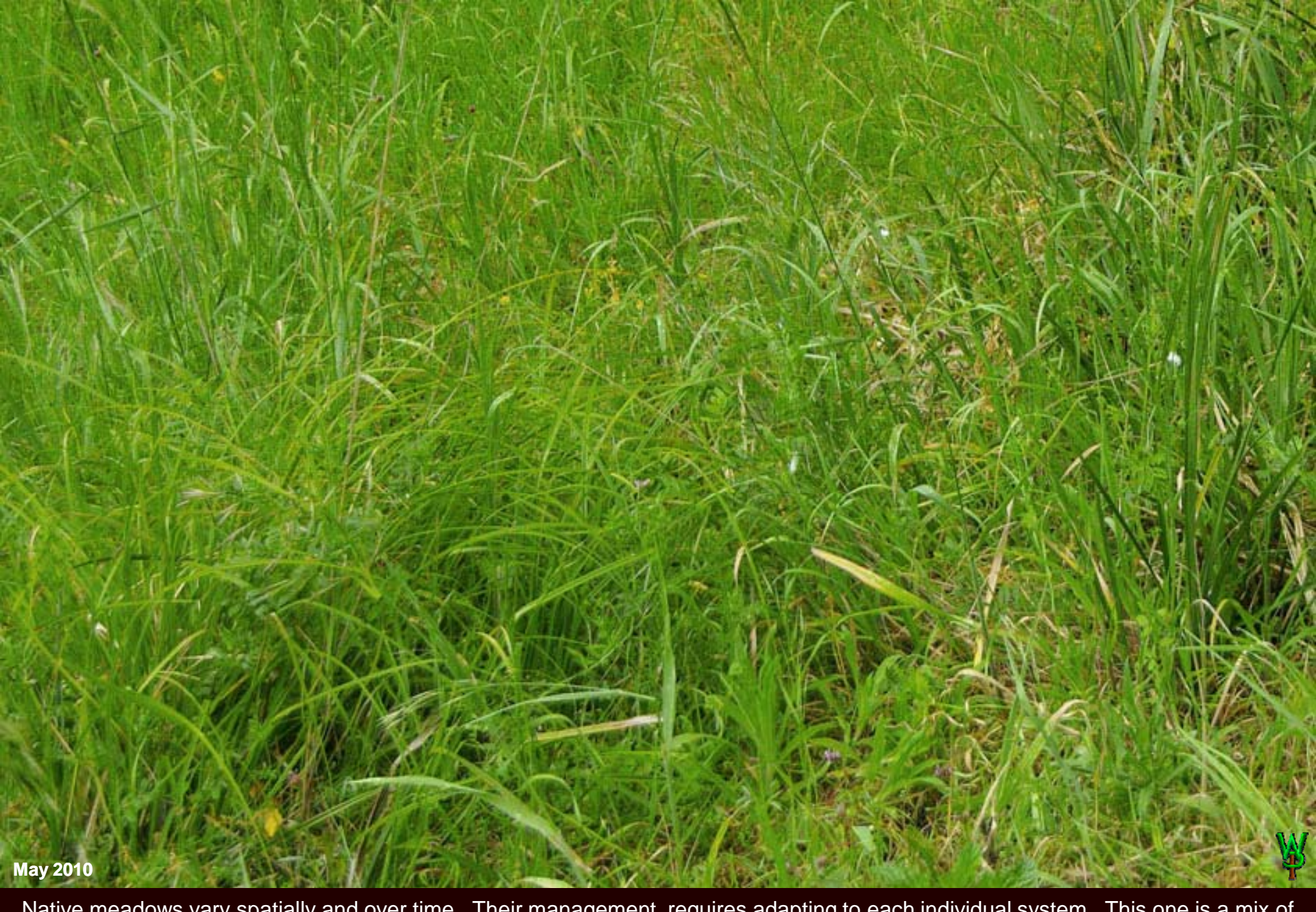
Native meadows vary spatially and over time. Their management requires adapting to each individual system. This one is a mix of California brome ( B. carninatus ), purple needle grass ( S. pulchra ), blue wild rye ( Elymus glaucus ), Western fescue ( F. occidentalis ), coastal tufted hair grass ( Deschampsia caespitosa ) Santa Barbara sedge ( Carex barbarae ), and the usual lotuses.