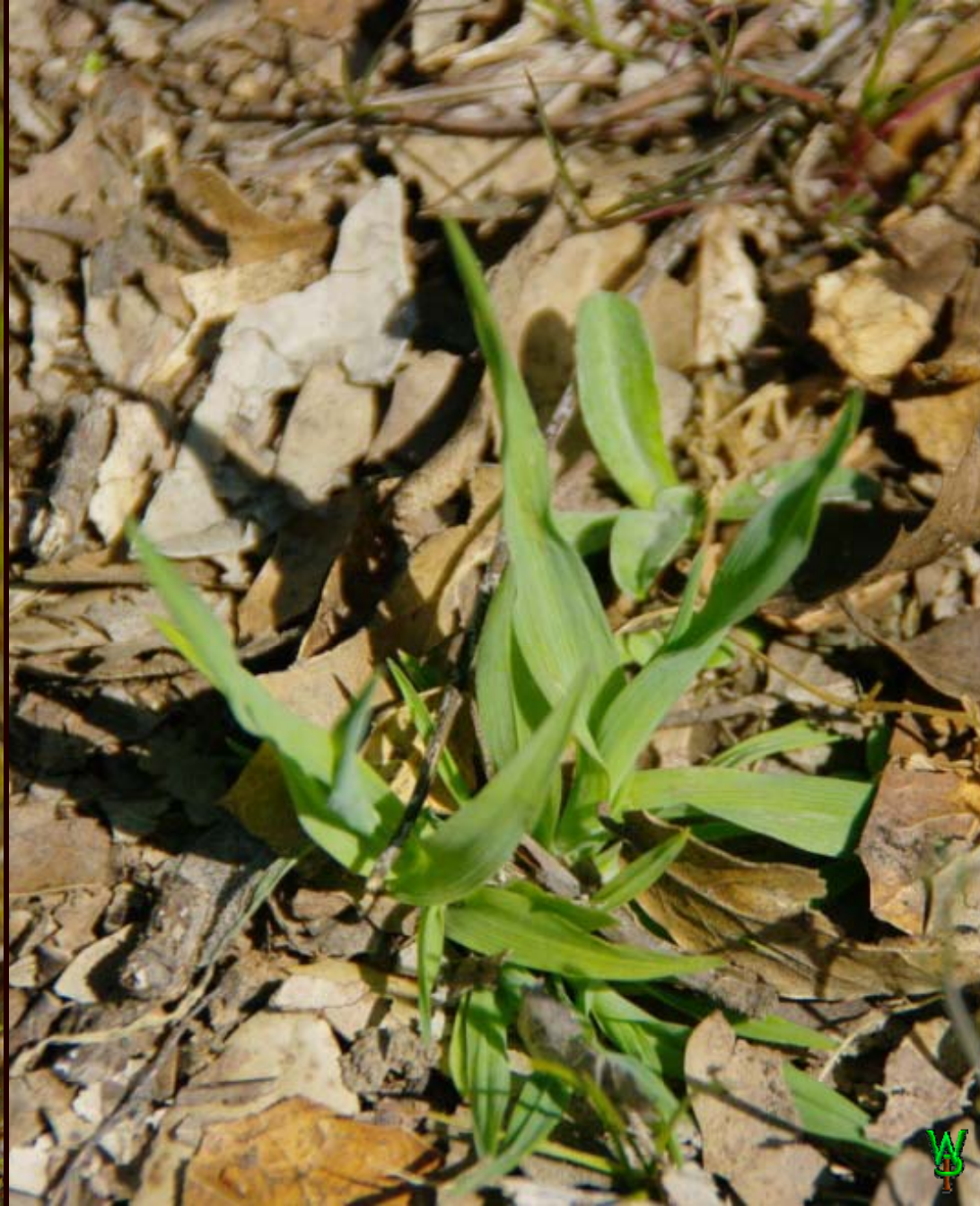
Poa annua again, showing the classic decumbant curl as it grows to a more erect form.