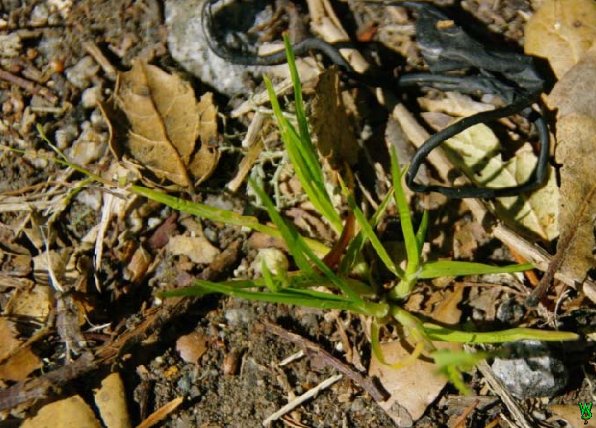
Early germination, small, yellow-green, shiny, smooth texture, decumbant, no twists, therefore Poa annua .