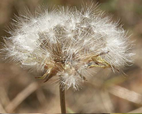
annual agoseris ( A. heterophylla )