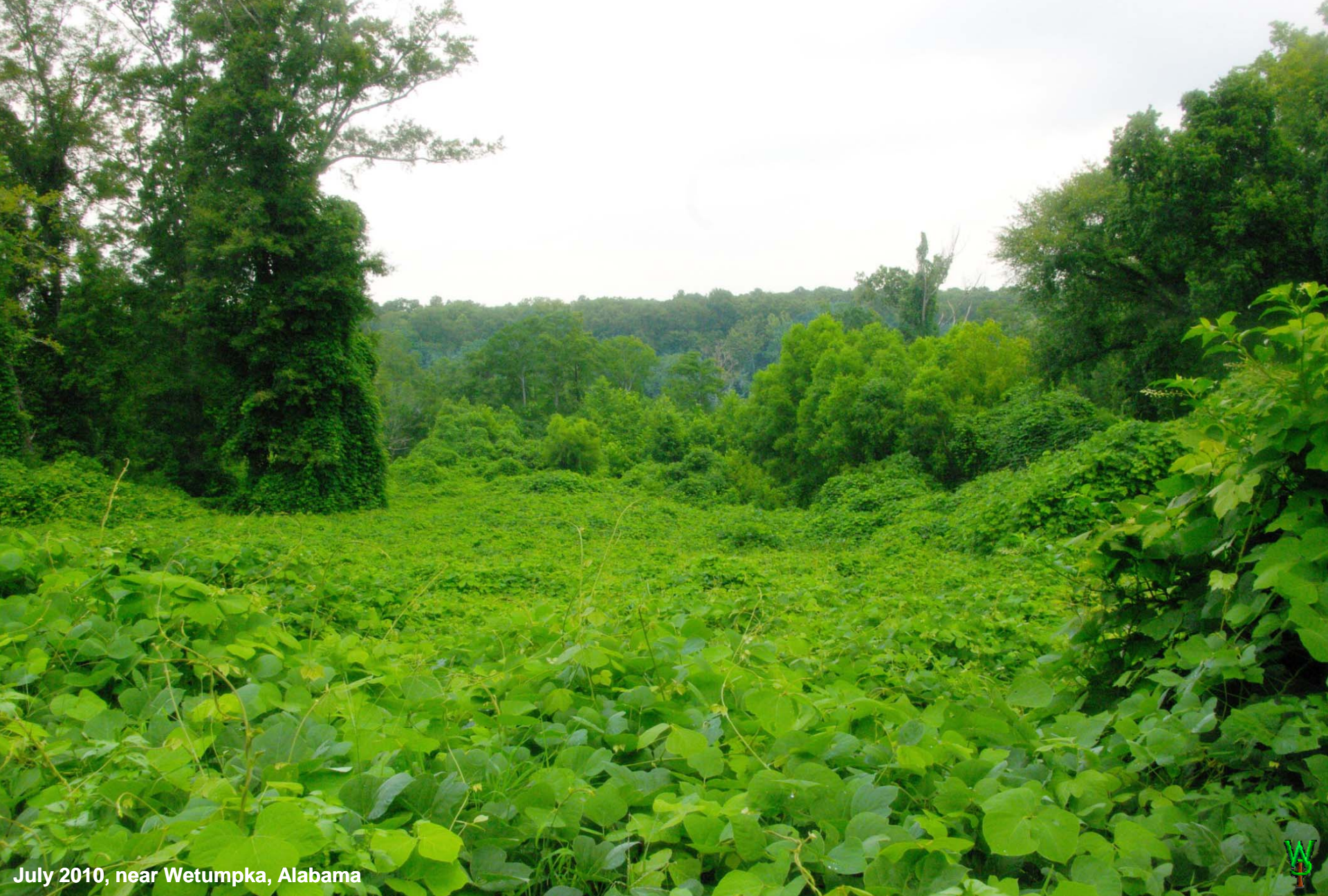
July 2010, near Wetumpka, Alabama

As a special subset of “bad plants,” invasive exotics build massive monocultures, meaning that they tend to exclude all other plants. These pests are displacing native plants, worldwide. The US Soils Conservation Service introduced kudzu as an erosion control... Well, it certainly worked for that.