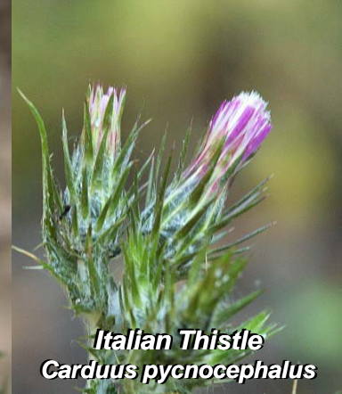
Italian Thistle Carduus pycnocephalus