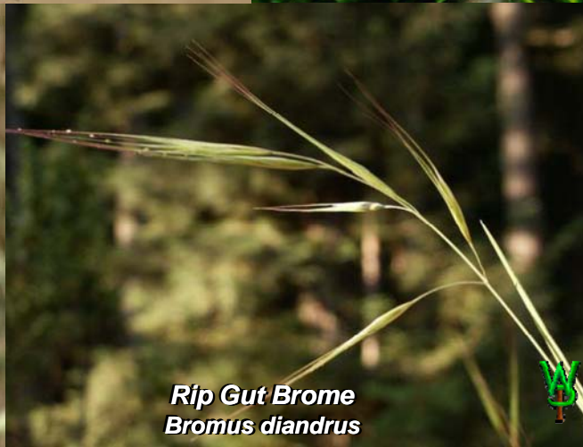
Rip Gut Brome Bromus diandrus

As a final element to this, “Are non-natives always bad?” question, almost all of the exotic plants we are talking about are those that people have already found to be generally undesirable for residential or agricultural use. Most would be considered bad plants just about anywhere.