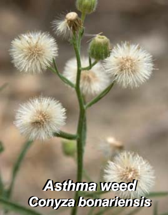
Asthma weed Conyza bonariensis