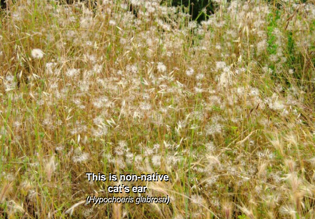
This is non-native cat's ear ( Hypochoeris glabrosa )