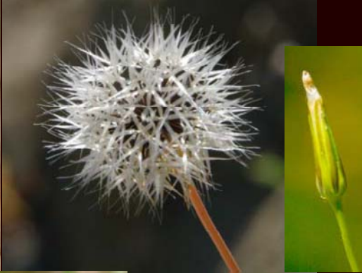
silver puff dandelion ( Uropappus lindleyi )