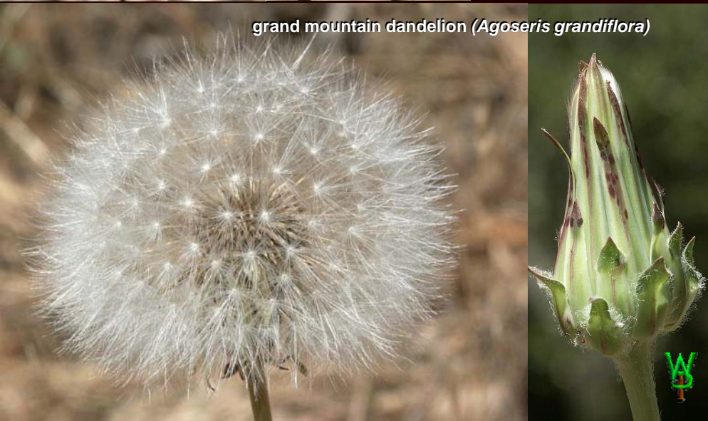
grand mountain dandelion ( Agoseris grandiflora )

People often ask me how we even know whether or not a plant is native. In some cases the determinants are easy: Some plants, such as redwoods, occur without human propagation in only one region of the world. Some evidences are more subtle but still definitive, such as fossils or pollen in annual mud strata found in stable ponds and lakes. A few cases are not much more than educated guesses; in fact, I have identified a couple of possible errors in the botanical record. Still, I would hazard that the determination of whether a species is native or not is probably better than 99% accurate overall. Unfortunately, that less than 1% was nearly disastrous for us and continues to be an annoyance.