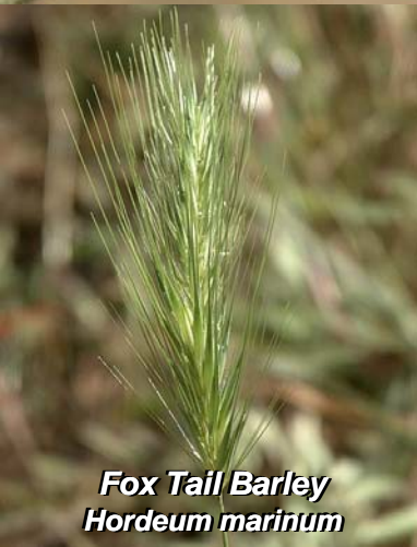
Fox Tail Barley Hordeum marinum