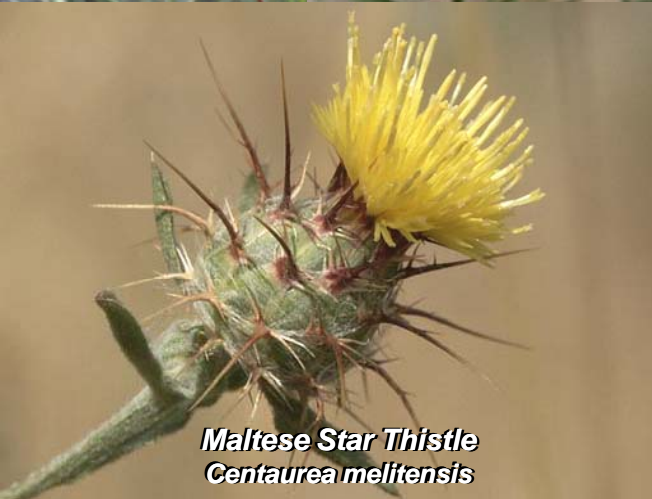
Maltese Star Thistle Centaurea melitensis