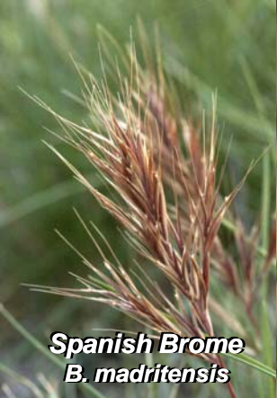
Spanish Brome B. madritensis