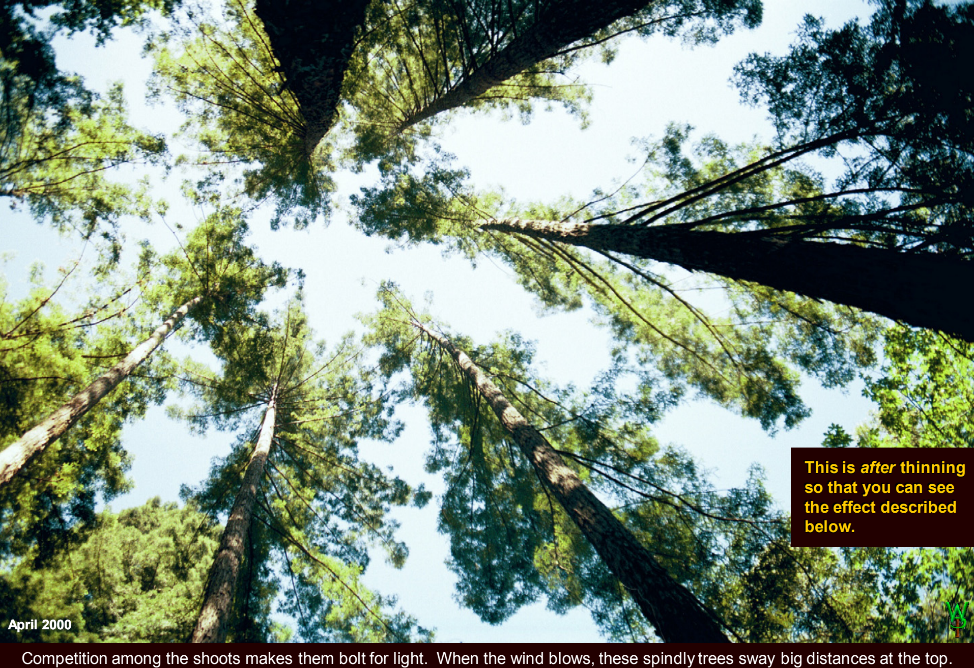
Competition among the shoots makes them bolt for light. When the wind blows, these spindly trees sway big distances at the top. They slap into each other. Sometimes the trunk breaks off entirely. Shearing and collision breaks off branches between trees while a lack of light starves branches toward the middle of the cluster. The branches they retain are either at the very top or directed away from the center of the original tree in the same direction in which they lean. The right thing to do was to thin them.