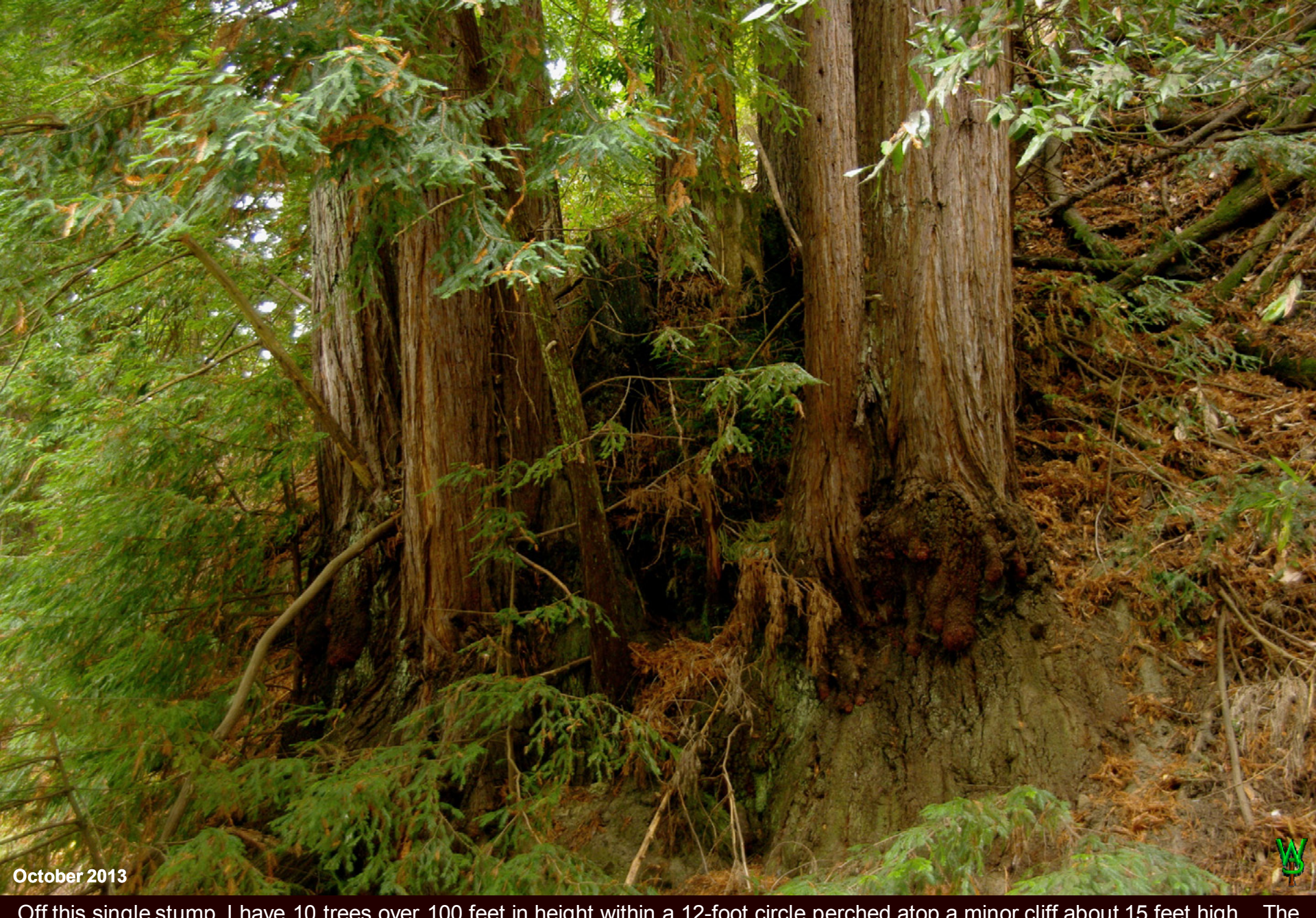
Off this single stump, I have 10 trees over 100 feet in height within a 12-foot circle perched atop a minor cliff about 15 feet high. The leverage against this steep slope of loose fluff on hard sandstone is such that it will eventually fail. It will be very tricky to log without damaging the uphill trees. The reason I have not fixed this problem yet is that I can't afford it. I could if I could sell the logs.