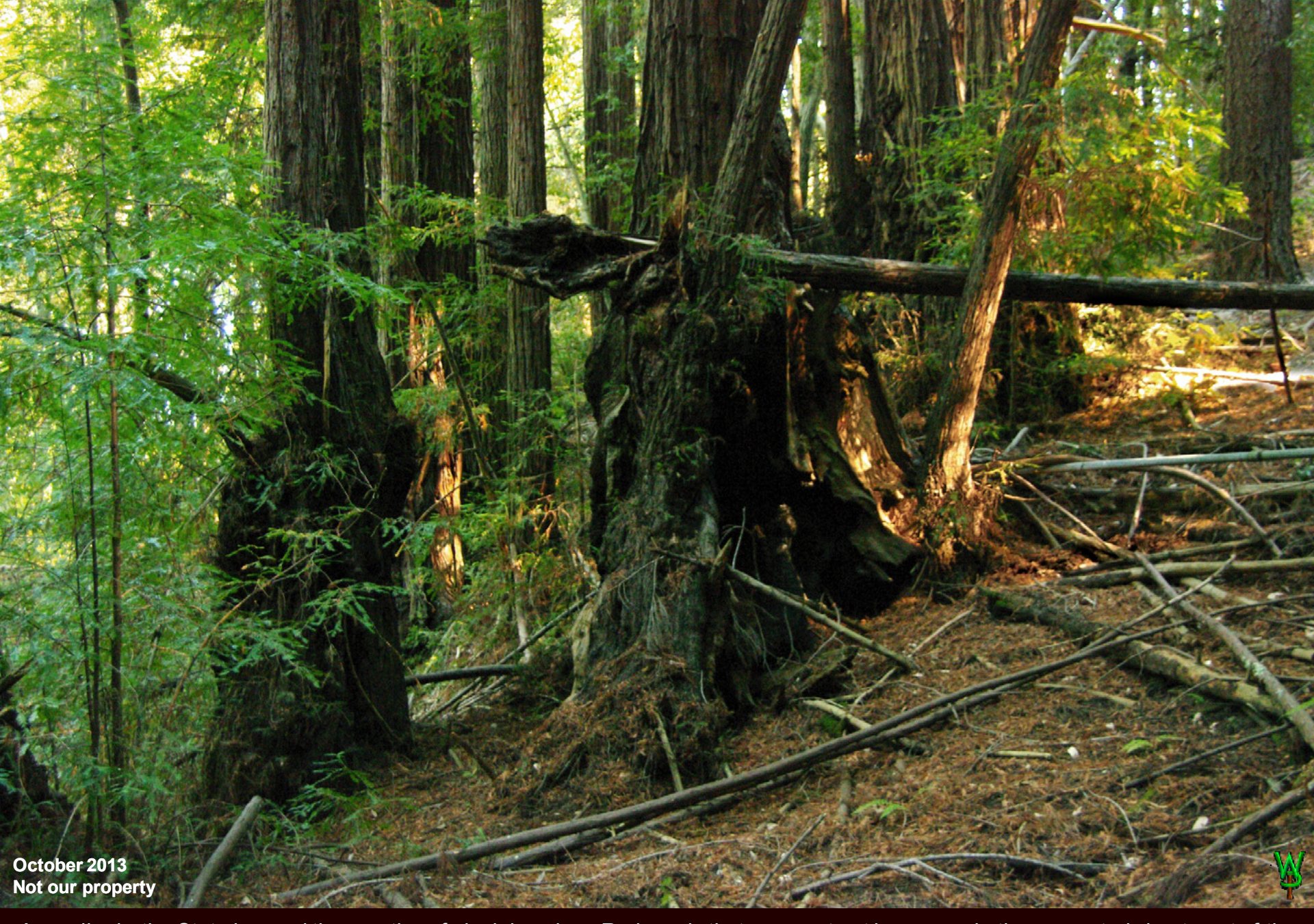
Accordingly, the State banned the practice of slash burning. Redwoods that were not cut low enough, then sprouted shoots out of the side of the stump, bending upward in search of light, growing away from each other while hanging from a rotting foundation.