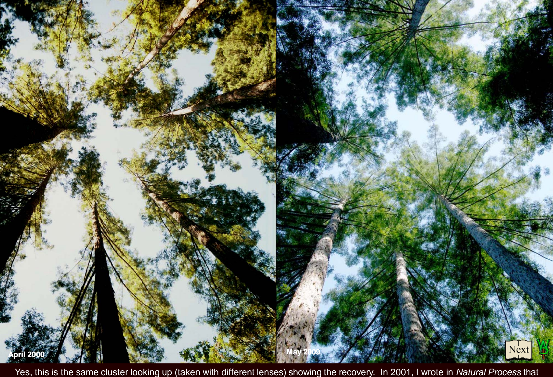
Yes, this is the same cluster looking up (taken with different lenses) showing the recovery. In 2001, I wrote in Natural Process that these trees would sprout branches and straighten, but in 2009 I could hardly believe the change! They even realigned themselves to a degree in their race for light. In another decade or two, this cluster should be thinned down to three but at that time I can also allow a few of the sprouts to develop. Then it can probably go for another hundred. Slower growth makes better trees and better lumber.