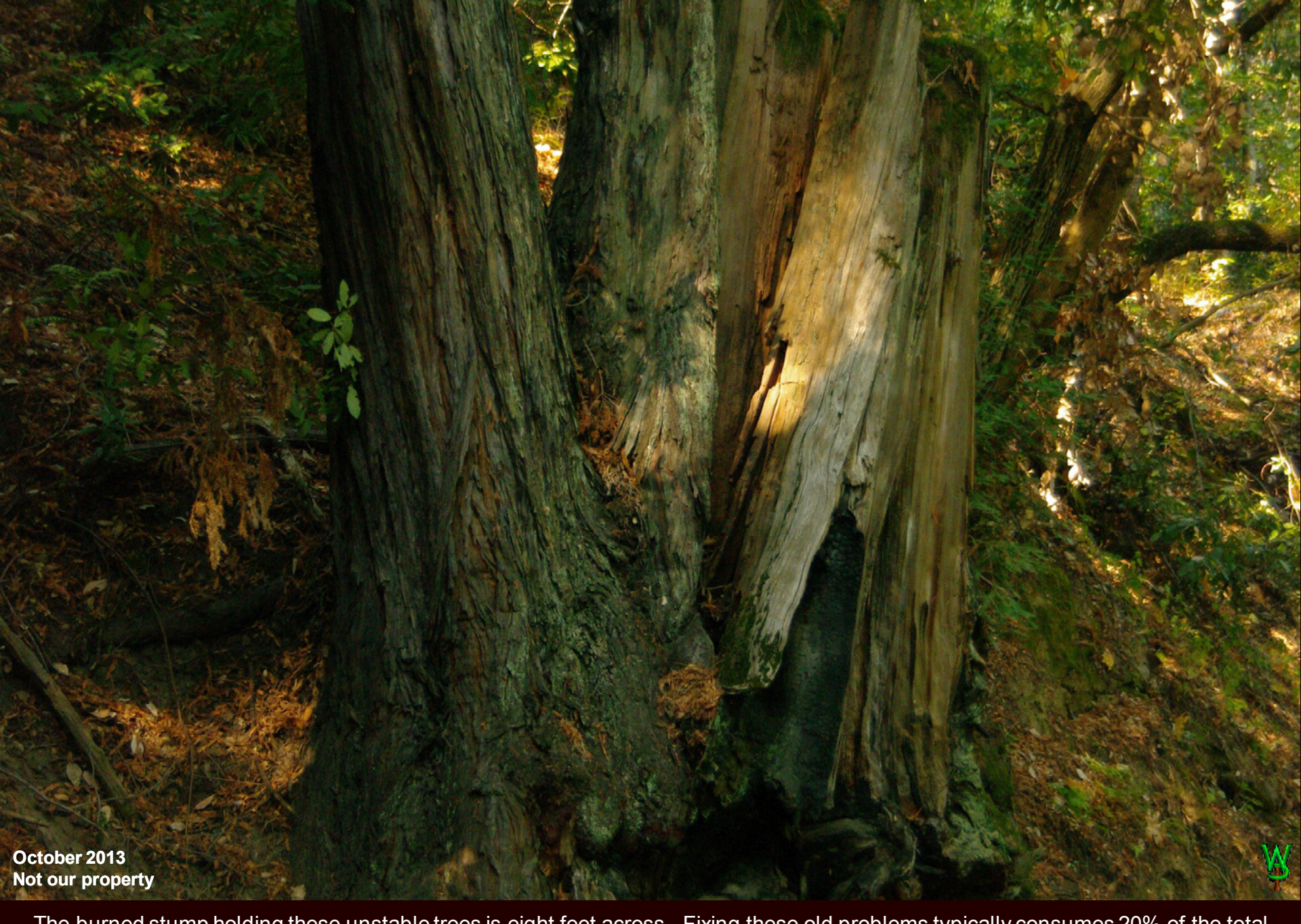
The burned stump holding these unstable trees is eight feet across. Fixing these old problems typically consumes 20% of the total revenue from a timber harvest. Worse, the wood from gravitationally stressed logs like these is apt to curl when it is milled.