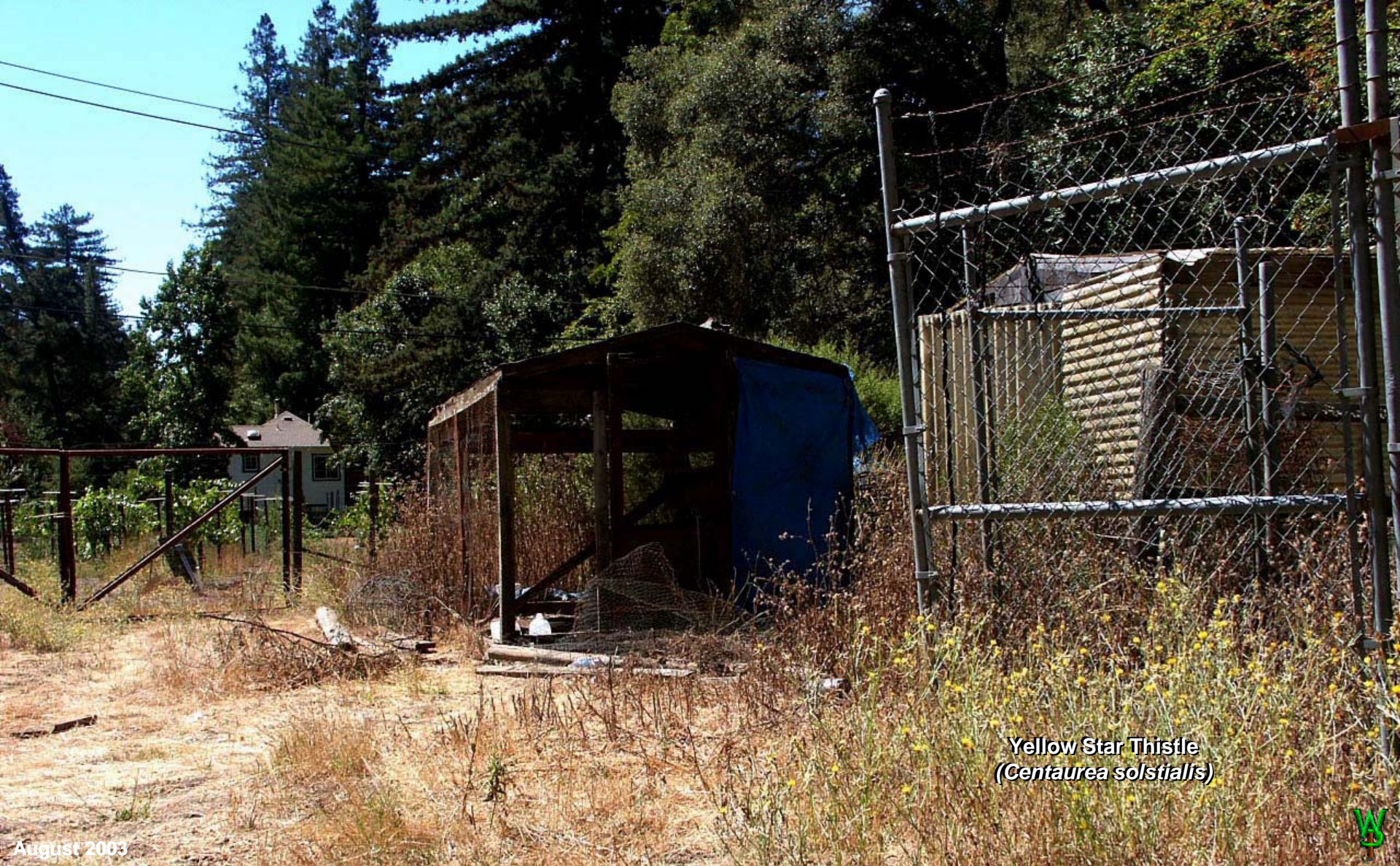
Yellow Star Thistle ( Centaurea solstitialis )